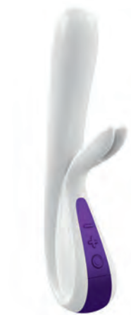
matt white - matt metallic lilac