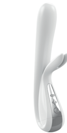
matt white - glossy chrome